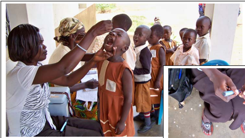
Children completing the vaccination are marked.▶

Shiloah Ministries Incorporated – 100% of donations are applied as specified