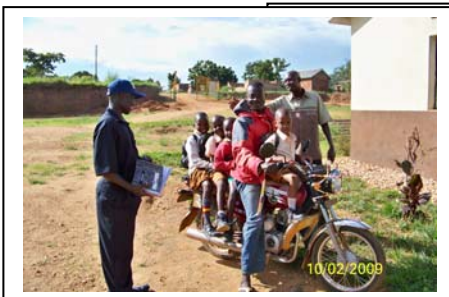
Parent brings/picks-up his kids