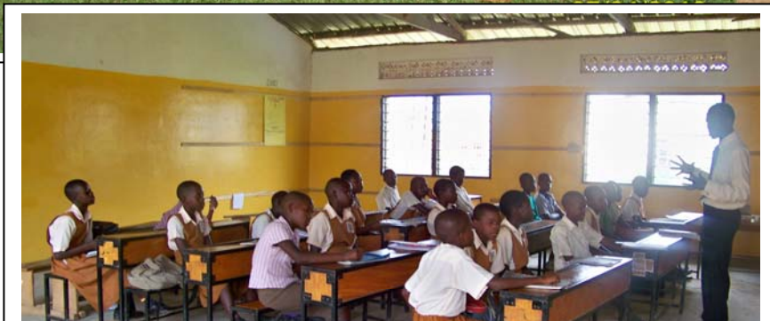
New class room finish