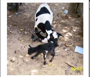
(about $8,500) for