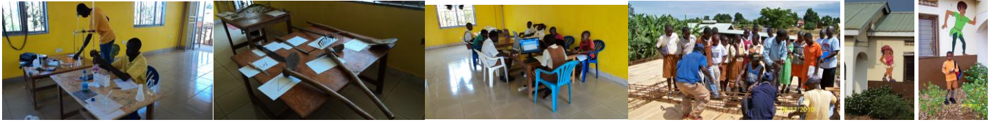
From Chemistry & Agriculture Lab. to computer practical's. construction seminar and Day Spring Art class

in this term and currently we need to pay a balance of about $2,300 (your special gift is received with thanks). A storm on June 28 provided a direct lightning strike on our Admin building. We are OK. However, not so with the TV, my computer, a