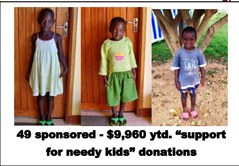
49 sponsored - $9,960 ytd. "support for needy kids" donations

We added computers, electric sewing machine, and full chemistry/physics demonstration laboratories. The 2003 Toyota Bus enlarged student door-to-door transport service (44 participants - above photo); and two of these three (left) have come to ask for assistance, as their father died in a motorcycle accident.