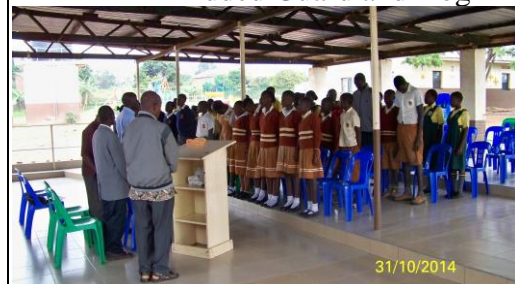
PLE Assembly with admin staff