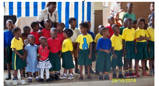
Primary and KG (junior choir)