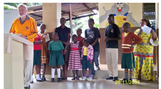
Top student Class award