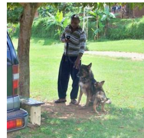
Added Guard and Dog