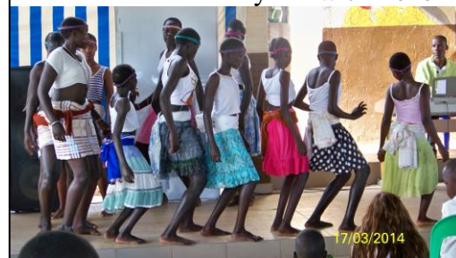
Sudanese Primary Students ▲