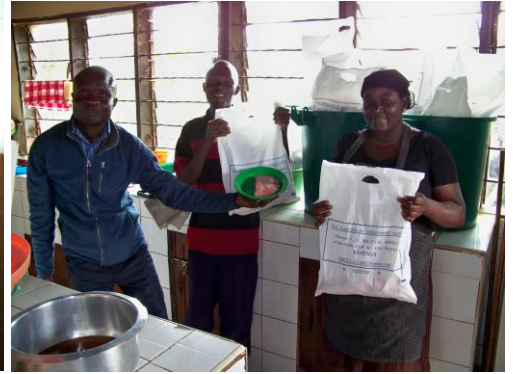
Turkish Light Academy Gift

HELP is their plea (and ours) in school fees and family support, given mostly through DAY SPRING CHRISTIAN CHURCH. This year again we enjoyed the thanksgiving spirit from our neighbor, Turkish Light Academy (Secondary School celebrating a holiday of giving) We received a “half beef” to feed children and staff.