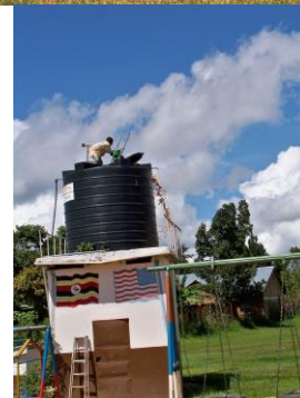
Cleaning and water prep. for start