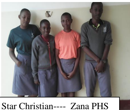
Morning Star Christian---- Zana PHS