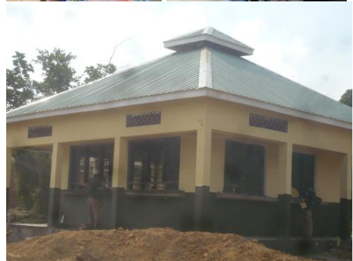
Kitchen for Morning Star