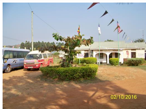
Games + Food at Preregistration Day