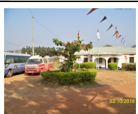
Day Spring recruiting day

Matt. 10:42 "[ ] whoever in the name of a disciple gives to one of these little ones even a cup of cold water to drink, truly I say to you, he/she shall not lose his reward"