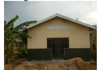
Bathrooms building & Water Tower